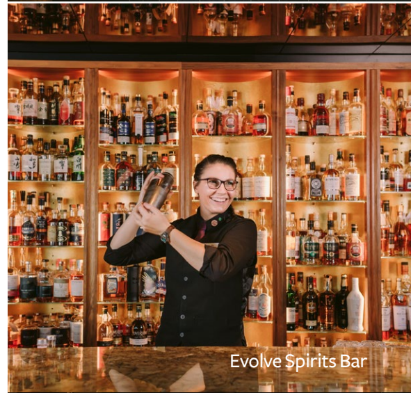
Evolve Spirits Bar