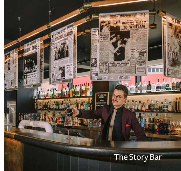
The Story Bar

The Lounge pays homage to the Mouheneenner people with elements of their culture throughout. A local stonemason crafted the open fireplace with shared stories in mind. A pre-dinner crisp white with Pacific oysters often encourages fables to flow. The menu is all-day. The Lounge is spotted with artifacts representative of the traditional Tasmanian Aboriginal toolkit, proudly made by modern indigenous descendants of the first Tasmanians. The light feature situated over the fireplace draws its inspiration from organic shapes formed by nature's four primary elements of water, earth, air and fire. The tradition of a family gathering and storytelling around the open fire, just as our ancestors have been doing for millennia, is carried forward in spirit.