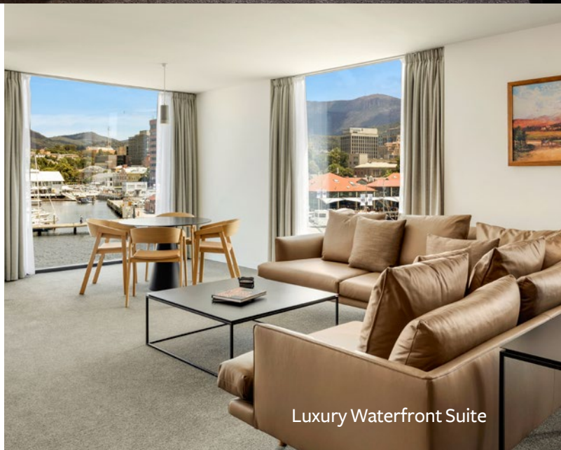
Luxury Waterfront Suite