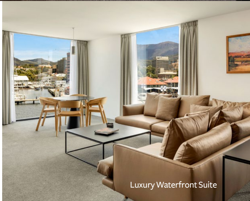
Luxury Waterfront Suite