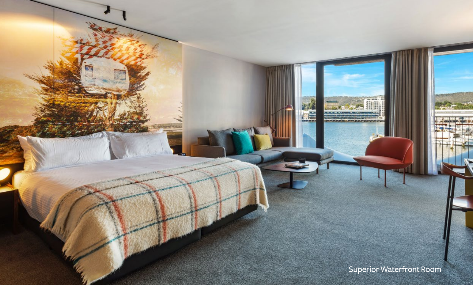
Superior Waterfront Room