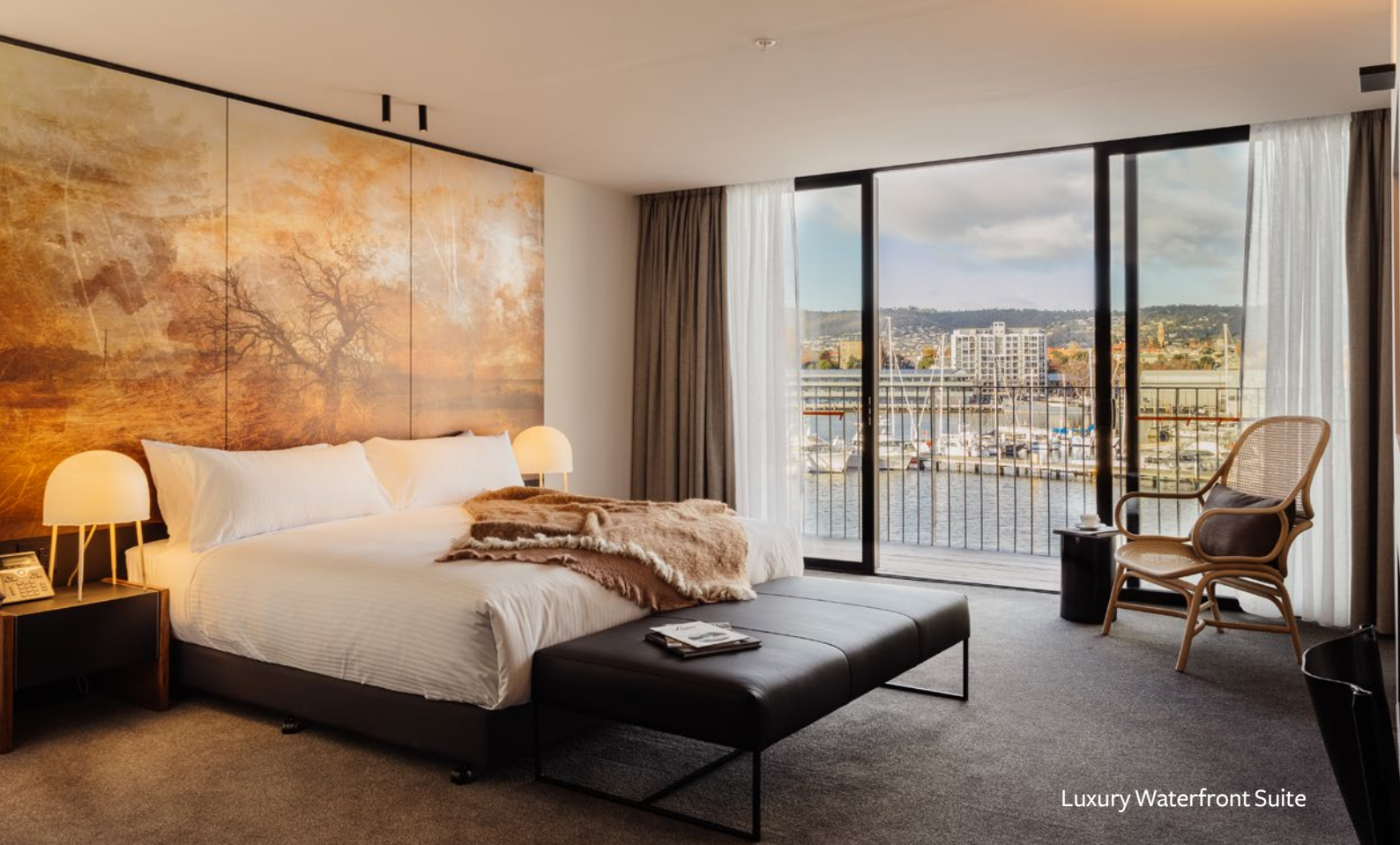
Luxury Waterfront Suite