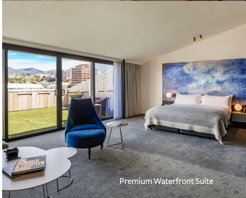
Premium Waterfront Suite