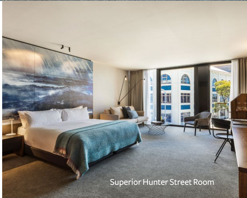
Superior Hunter Street Room