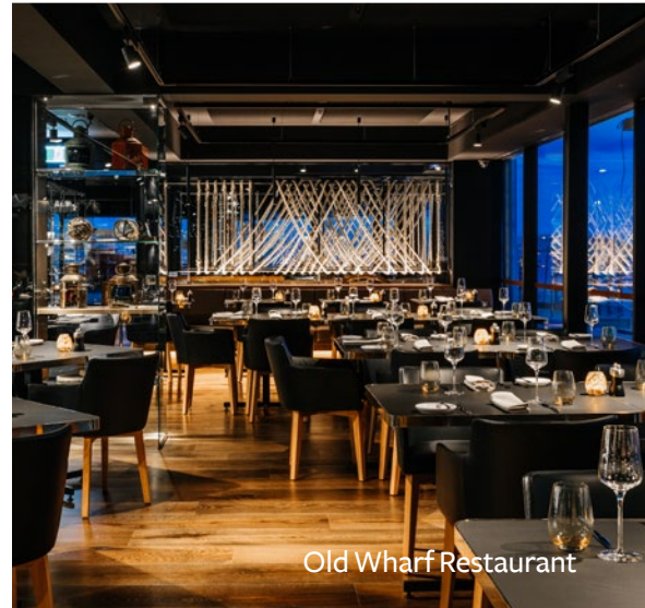
Old Wharf Restaurant