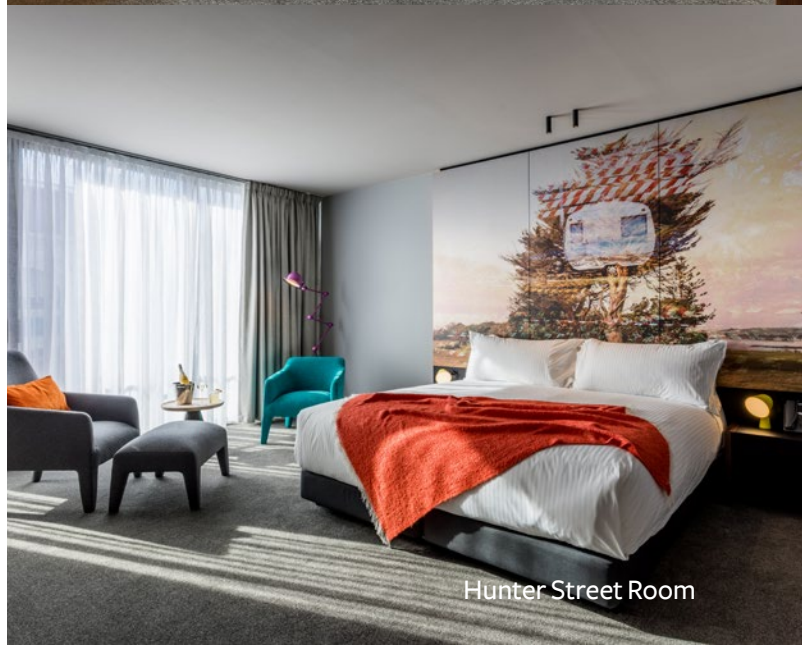
Hunter Street Room