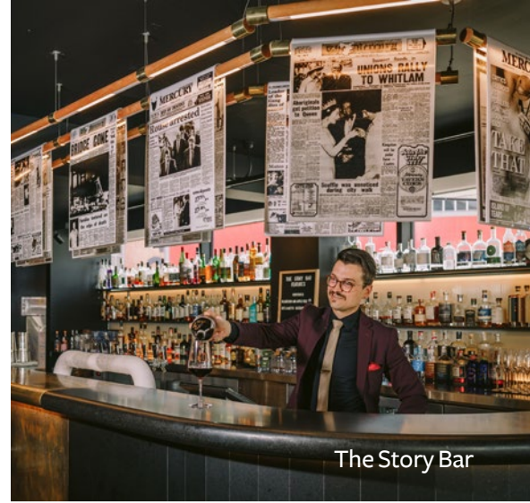
The Story Bar

The Lounge pays homage to the Mouheneenner people with elements of their culture throughout. A local stonemason crafted the open fireplace with shared stories in mind. A pre-dinner crisp white with Pacific oysters often encourages fables to flow. The menu is all-day. The Lounge is spotted with artifacts representative of the traditional Tasmanian Aboriginal toolkit, proudly made by modern indigenous descendants of the first Tasmanians. The light feature situated over the fireplace draws its inspiration from organic shapes formed by nature's four primary elements of water, earth, air and fire. The tradition of a family gathering and storytelling around the open fire, just as our ancestors have been doing for millennia, is carried forward in spirit.