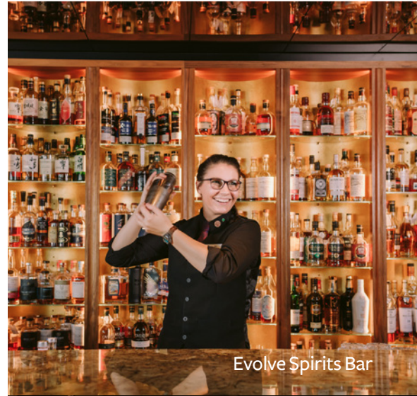
Evolve Spirits Bar